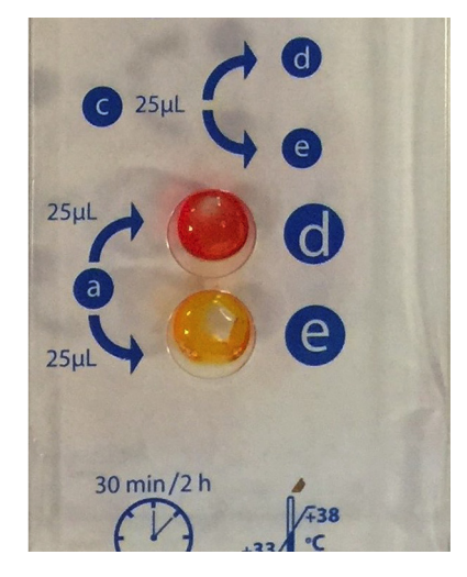
FIG 1 Representative photo of positive Rapidec Carba NP test result exhibiting a significant color variation between wells d (test control) and e (test isolate). The isolate is KPC-producing K. pneumoniae BAA-1705.

to empirically prescribe ceftazidime/avibactam for an infection in which the pathogen would be resistant. As backup, the BD Phoenix CPO Detect is currently accompanied by a ceftazidime/avibactam susceptibility test and should accommodate additional newer \beta -lactamase inhibitor combinations as they become available.